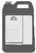
TT-3 TUFF TECH OIL